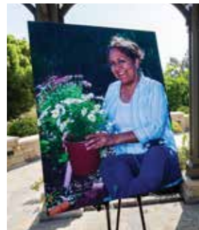
Photo Collage Boards

(Photo editing available at an additional $50 per hour, noted enlargement sizes are approximate)